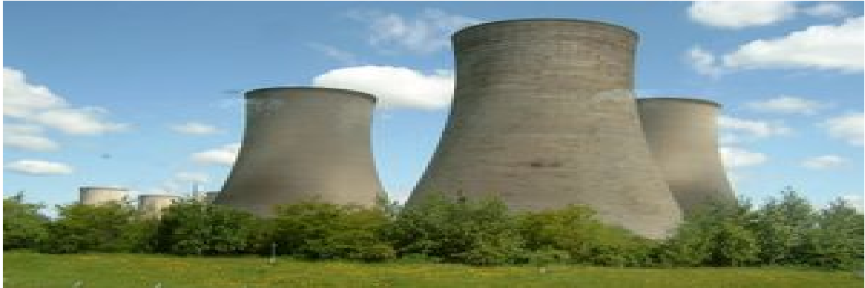
Figure 1: Natural draft wet cooling hyperboloid towers at Didcot Power Station, UK [1].

This report focus on shower cooling towers. In the report a model for heat and mass transfer in a cooling tower is derived. Simplifications of the calculations are made and discussed. An introduction to the use and construction of cooling towers is given.